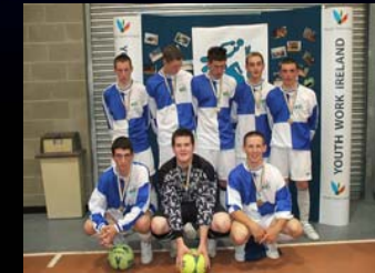
ST. BRIGID'S U18 SOCCER TEAM