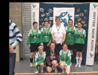
FANAD U15 SOCCER TEAM