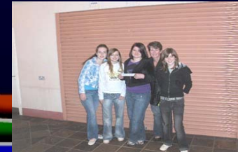
MALIN HEAD YC U15 QUIZ TEAM